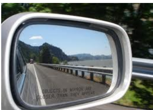
Before Balanced Scorecard