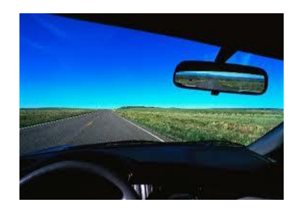
What Balanced Scorecard can Accomplish

"Don't drive your organization by looking through the rearview mirror" is one saying often heard from Balanced Scorecard enthusiasts as they transformed their measuring and monitoring from looking at past performance to looking at current and future performance. This is accomplished by translating the organization's mission into four equal perspectives of performance and strategy. The foundation of the Balanced Scorecard instills a culture of learning and growth in employees, which emphasizes individual value and guides employees to identify their unique role in serving the organization's mission. This, in turn, can improve performance, productivity, and culture. The internal processes perspective drives operational tasks focused on the organization's mission and strategy and has the potential to minimize the current workload by only focusing on essential mission-driven tasks.