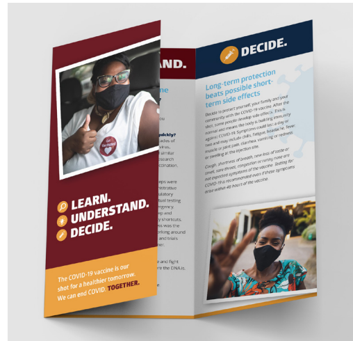
Learn. Understand. Decide: The COVID-19 vaccine is our shot for a healthier tomorrow.

Two brochures are available that provide straightforward facts about the COVID-19 vaccine. Learn. Understand. Decide addresses common myths and concerns many rural Americans share. A brochure was also developed to answer parents' questions about getting their kids vaccinated, especially younger children. With the real facts in hand, individuals are empowered to make an informed choice about vaccination for themselves and their families.