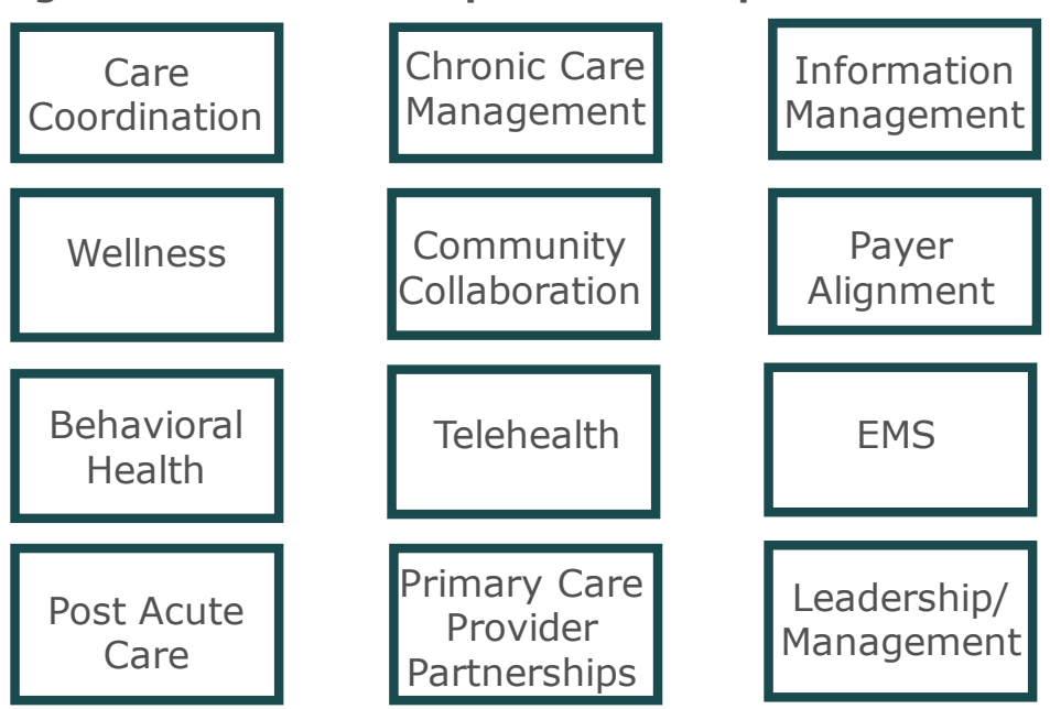
Figure 2: Essential Components of Population Health

Although the term "population health" has progressively become more wide-spread among health care providers, there is a recognition in the industry that the adoption rate and the acceptance of an industry shift toward value-based care has not been consistent across the nation. Recognition that fee-for-service is fueling unsustainable growth in costs, there has been a renewed focus among payors and policy advocates to address underlying issues such as uncoordinated care, poor chronic disease management and unhealthy behaviors that increase utilization and costs. However, rural providers have generally not seen the payors come to the table in a meaningful way to sustain low volume hospitals.