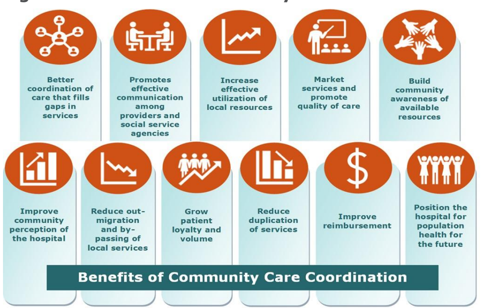
Figure 4: Benefits of Community Care Coordination<sup>7</sup>

For population health to be successful, the community partners must come together and take "ownership" of managing the health of the local population. Thus, person-centered coordinated care places an emphasis on a shared system that engages community partners and improves efficiency. The synergistic effect of the coordinated system of care within a rural community results in the delivery of higher functioning services than each individual agency would be able to provide by working alone. Coordination of local services not only supports an enhanced system that delivers better care to the community, but also benefits the rural hospitals, clinics and networks and other partners. Care coordination promotes effective communication among providers and social service agencies, increases effective utilization of local resources, and builds community awareness of available services. Most importantly, it positions the organizations and the community for population health of the future. Figure 4 below summarizes key benefits of community care coordination.